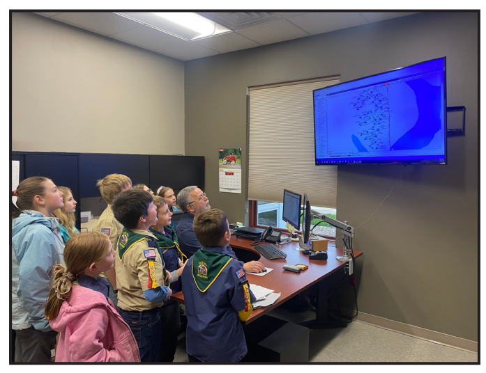
Cub Scouts view the PCEA outage center map and learn how lineman work to get power restored for members.

Cub Scouts get a tour of the PCEA shop while learning about all the equipment used for rural power.