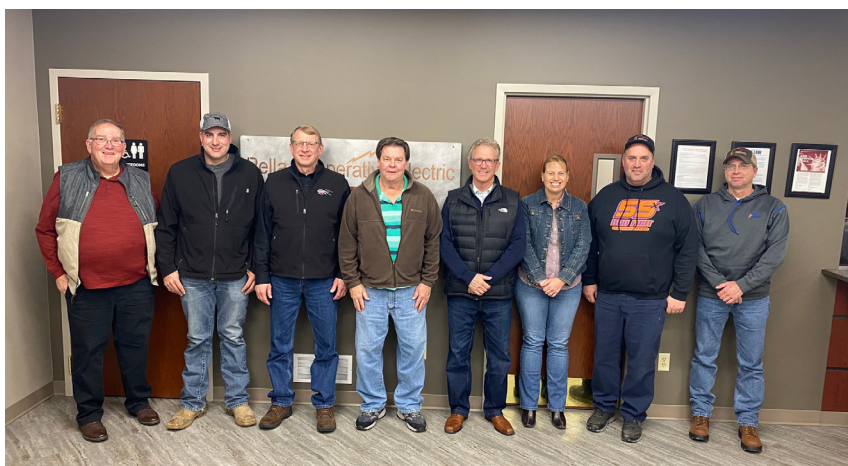
PCEA's 2021 Nominating Committee

If you're interested in serving on the nominating committee or have any questions about the process, don't hesitate to call the Cooperative at 1-800-619-1040.