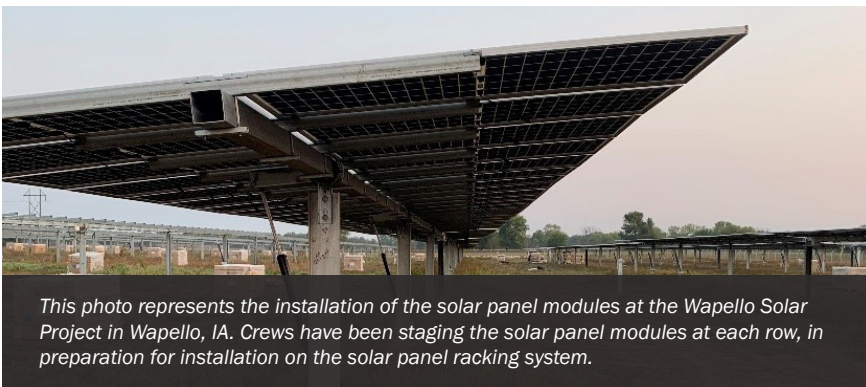
This photo represents the installation of the solar panel modules at the Wapello Solar Project in Wapello, IA. Crews have been staging the solar panel modules at each row, in preparation for installation on the solar panel racking system.

Owned and developed by Clēnera, LLC, Wapello Solar is well underway and on schedule to produce low-cost energy to CIPCO members like PCEA in early 2021.