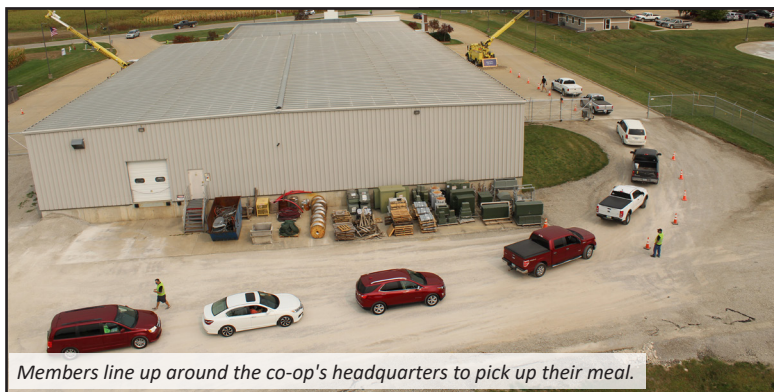
Members line up around the co-op's headquarters to pick up their meal.