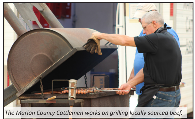
The Marion County Cattleman works on grilling locally sourced beef.

DAYLIGHT SAVING TIME REMINDER Don't forget to fall back on November 1! Set your clocks back by one hour.